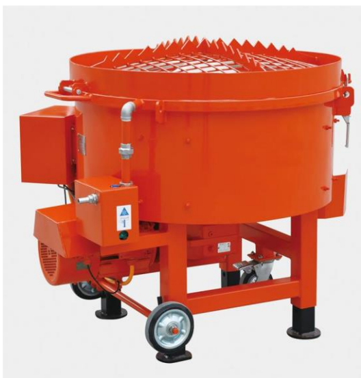
LRM100 & LRM250 Model

LRM refractory pan mixer is specially designed for mixing refractory, castables materials etc. Which is available in a stationary or practical mobile design, is characterised by top performances. In order to ensure easy to move in the working site, LRM100 and LRM250 refractory pan mixer is equipped with walking wheel, LRM500 have forklift hole in the frame. There is high wear-resistant steel liner in the mixer bottom and inner wall, five pieces different purpose mixing arms could ensure refractory materials mix evenly and void sticking.