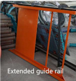
Extended guide rail