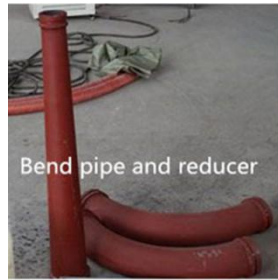
Bend pipe and reducer