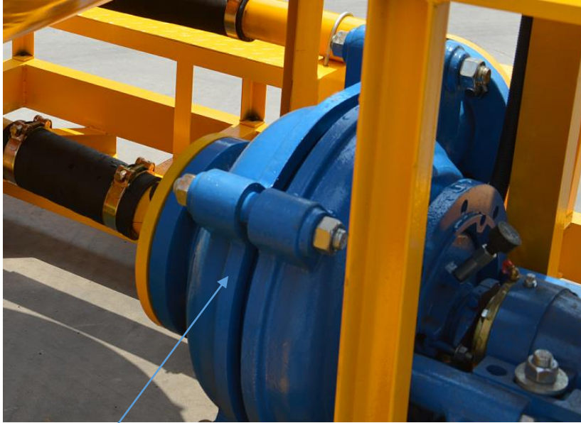
Heavy-duty Slurry pump for recirculating and discharging