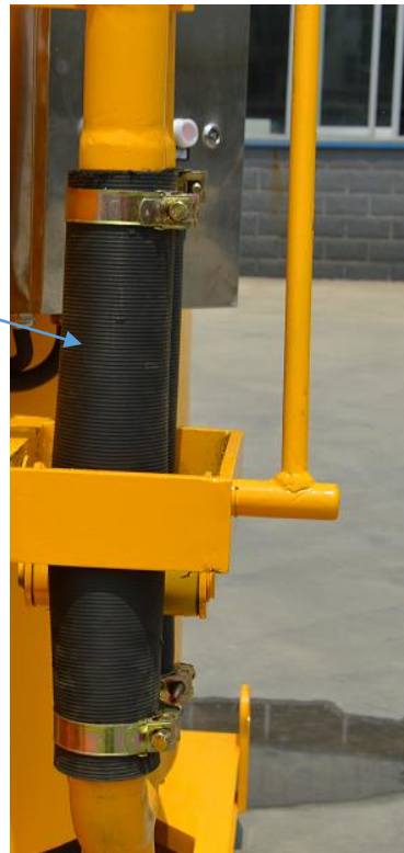
Special Design and Machining Squeeze Hose Valves with million times squeezing work life