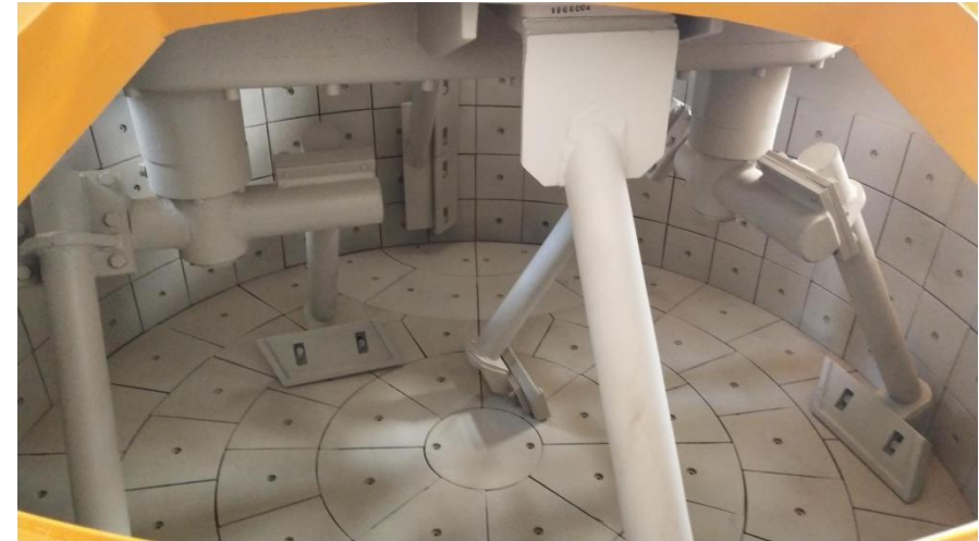
The counter-current mixing device makes the complex mixing locus and high efficient result. The reasonable load distribution of gearing system gives fast and thorough discharging