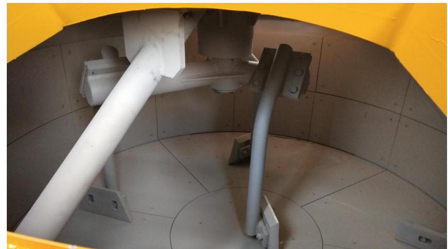
Cr-hard alloy cast iron liner and mixing blade.