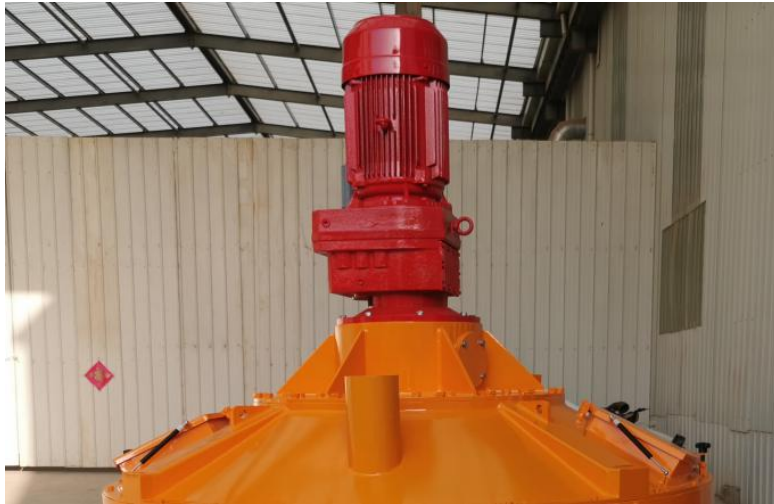
The counter-current gearing system has higher transmission efficiency, excellent mixing result and longer service life