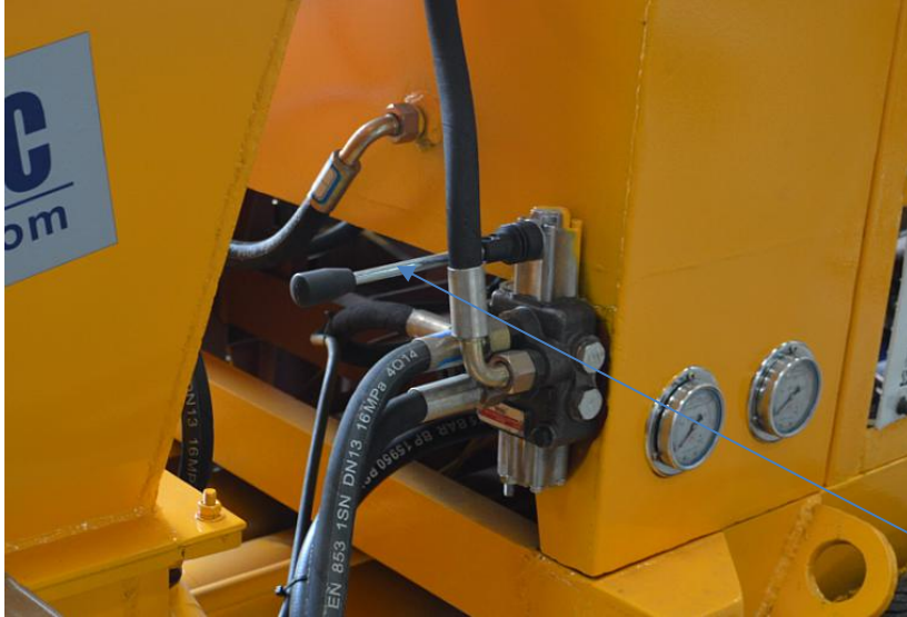
Hydraulic Valve of Agitator Forwarder and Reverse

电话 TEL: +86-371-63902781 传真 FAX: +86-371-63526676