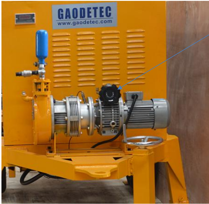
Additive pump stepless speed handle

电话 TEL: +86-371-63902781 传真 FAX: +86-371-63526676