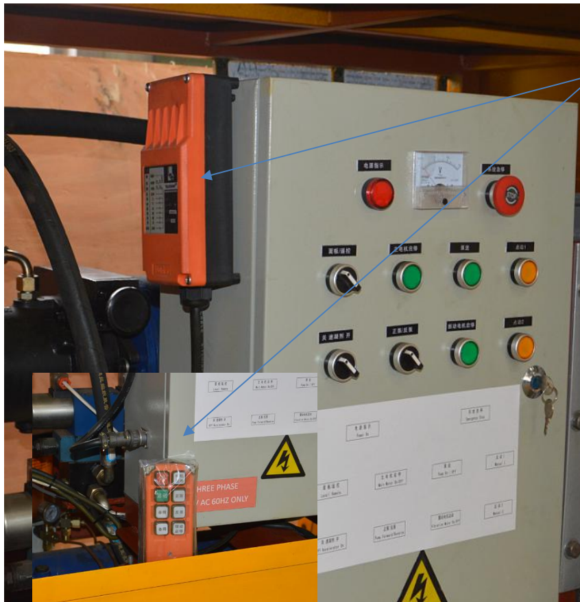
wireless remote control