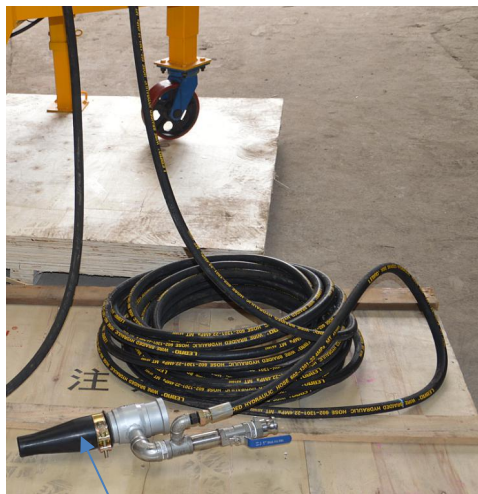
Shotcrete spray nozzle