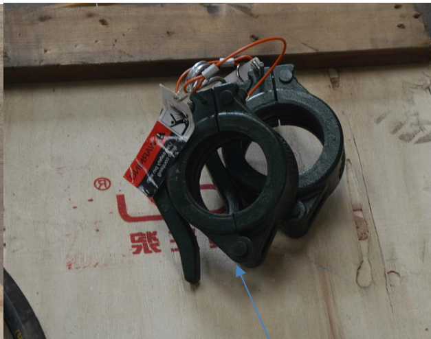
High pressure clamp