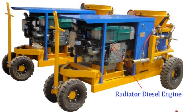
Radiator Diesel Engine