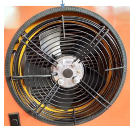
Air cooling system