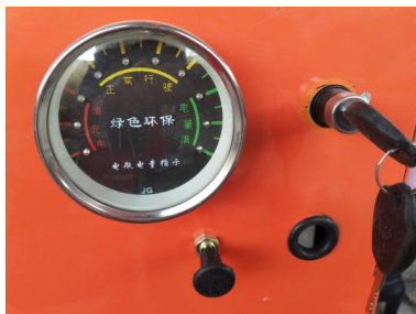
The electric switch