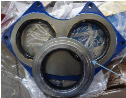
Swing tube valve