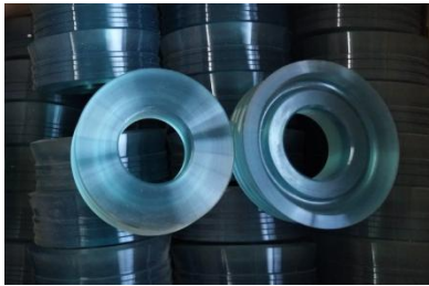
The foot brake